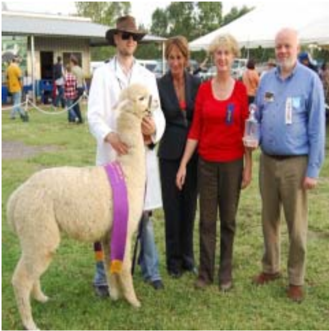
Supreme Champion Huacaya Wyndarra Designer