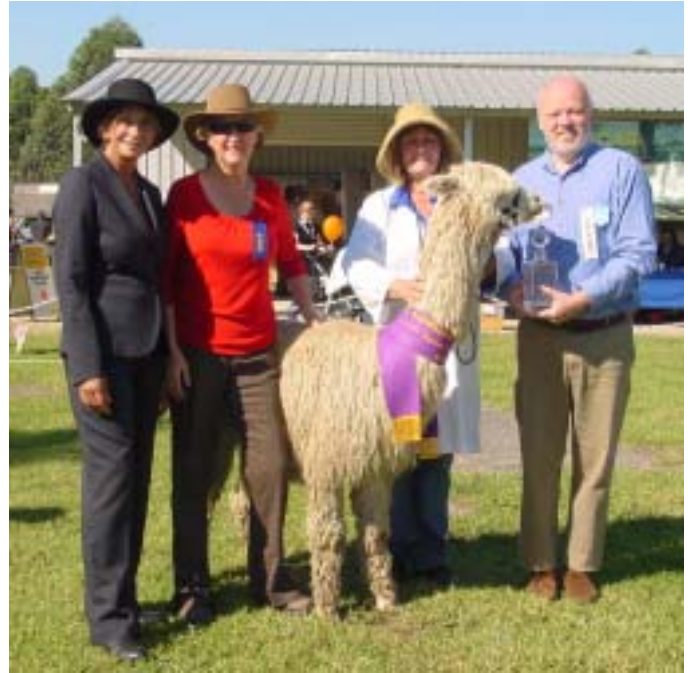
Supreme Champion Suri Kirrala Calypso

Given that all the regional media editorials had touted the event as being the starting point for the Hawkesbury's celebration of the National Alpaca Week, it was imperative that the show was a success. It was somewhat disappointing, therefore, that with a couple of weeks to go it seemed likely that the show would have to be cancelled due to insufficient entries.